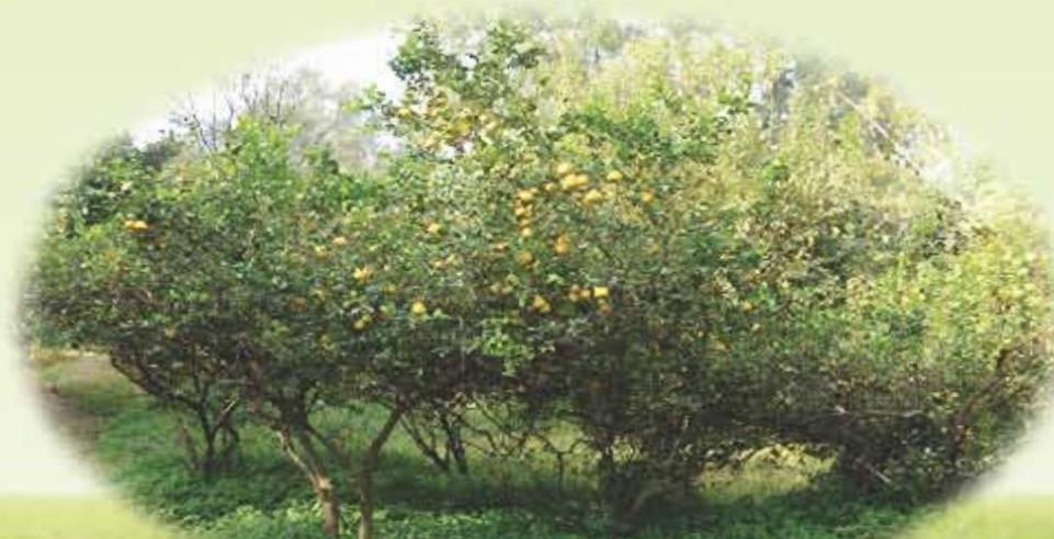
Host plant (Citrus Species)

Different life stages of butterfly have limited host plant range. To create a successful butterfly park the most indispensable and critical requirement is identification of host plants and continuous supply of food for consistent rearing of the life stages of butterflies. In the butterfly park department has planted host plants like Mango, Citrus, Salix, Ixora, Amla, Ashoka Etc. which are specific to 35 species of butterflies identified in this park.