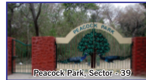
Peacock Park, Sector - 39