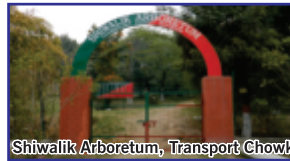
Shivalik Arboretum, Transport Chowk