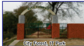
City Forest, IT Park

Department has developed following City forests and parks to improve the quality and quantity of the green cover in the city and to sensitize and generate awareness among the masses for protection and conservation of nature and natural resources. These city forests are at door steps of the residents of Chandigarh and are excellent place for nature walk.