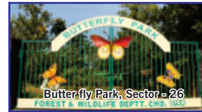
Butter fly Park, Sector - 26